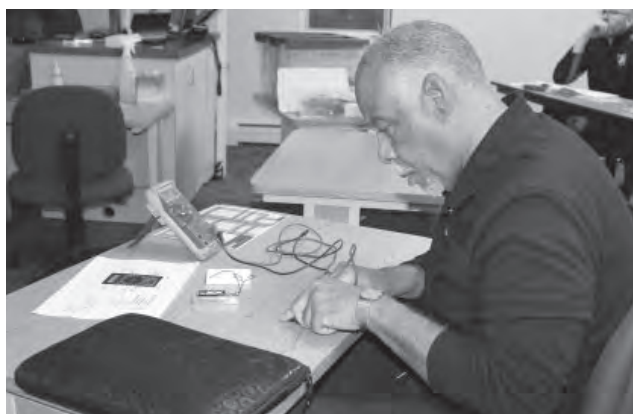
Circuit Electronics Class