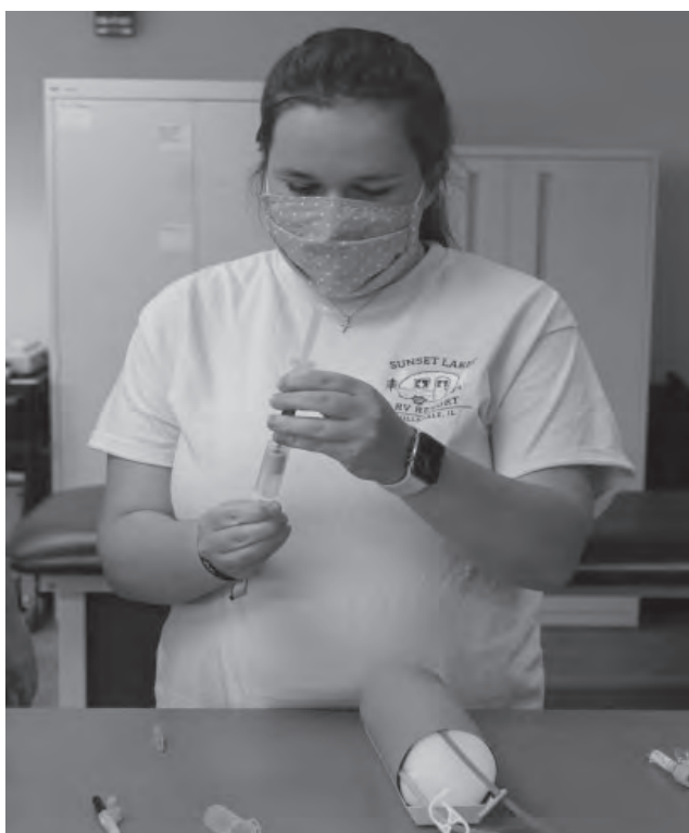
Phlebotomy Technician class