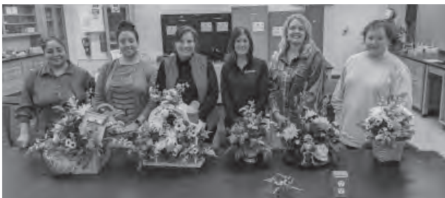
Floral Design Class

4 Wednesdays Aug. 7 - Aug. 28 5:45 - 7:45 p.m. Location: TBA Fee $200 In-person Class ID 1885